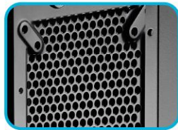
Rear ventilation opening-Can assemble 9, 12cm fan.