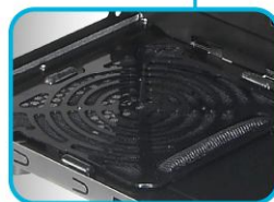
PSU dust prevention net-To prevent dust from entering the PSU.