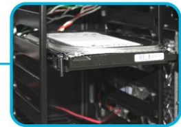
Screwless HDD track-To assemble HDD easily.