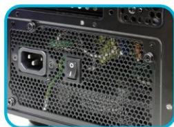
PSU in the bottom-Keeps chassis not only steady, without shaking, but also provide better air flow for PSU.