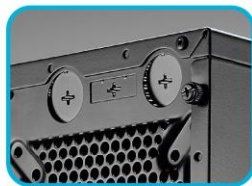
Support water-Cooling pipe.