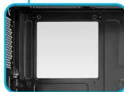
Don't need to remove the motherboard off when changing CPU fan.