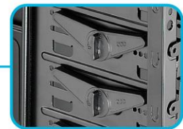
Screwless ODD-To assemble ODD easily.