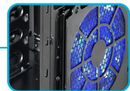
Front dust filter-To prevent dust from entering case (Optional). Can assemble 9, 12, 14cm fan.