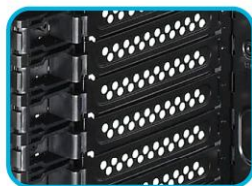
Mesh PCI Slot-With better ventilation, can support screwless PCI device and easy to assemble.