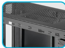
Top ventilation opening.