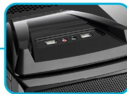
I/O module on the top of bezel-Users can more easily access to USB or AUDIO port.