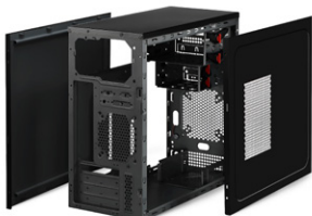
Optional Black interior painting